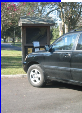
A familiar site along Riverbend Boulevard.

Reminder- If you pull over to use your cell phone near the main Riverbend entrance; please be courteous of other drivers and those residents who live among the boulevard. Do not block the entrance to Dakin Avenue.