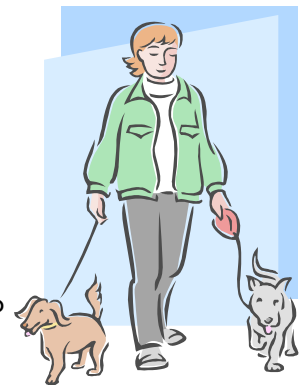
Don't forget your leash!

As a courtesy to your neighbors, please dispose of pet waste. Thanks go out to the many pet owners who carry plastic bags on their walks for this purpose.