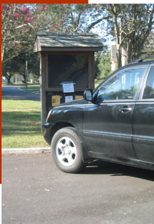
A familiar site along Riverbend Boulevard.